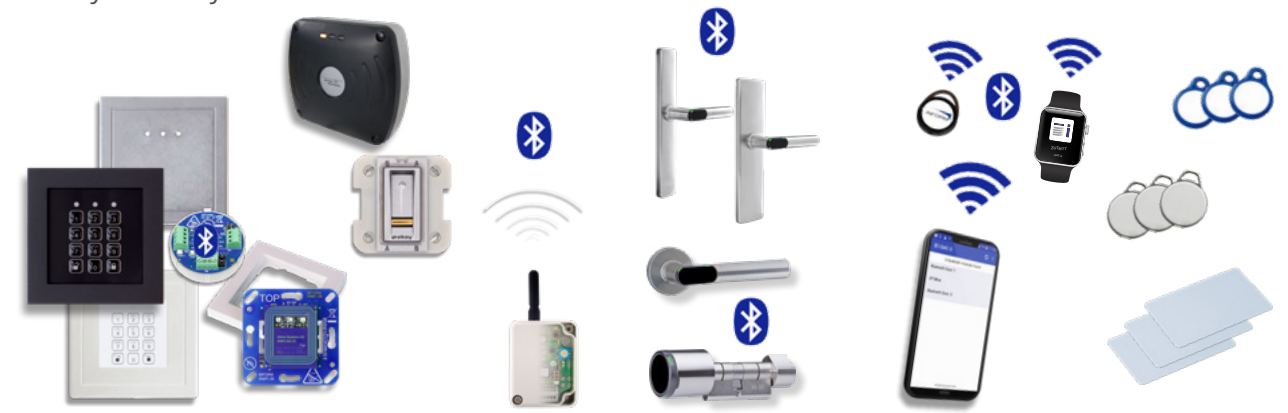
System and component construction as flexible as the wishes of your customers

From the smallest to the largest. Flexible installation and operation options on servers or in the cloud; remotely from anywhere in the world