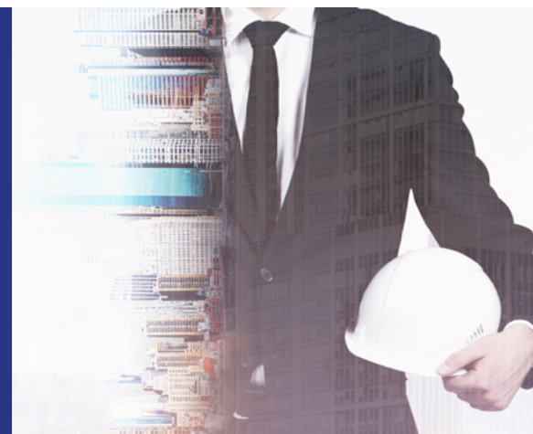
Variety in sales and production channels

Multi-dimensional variety and flexibility mark us out.